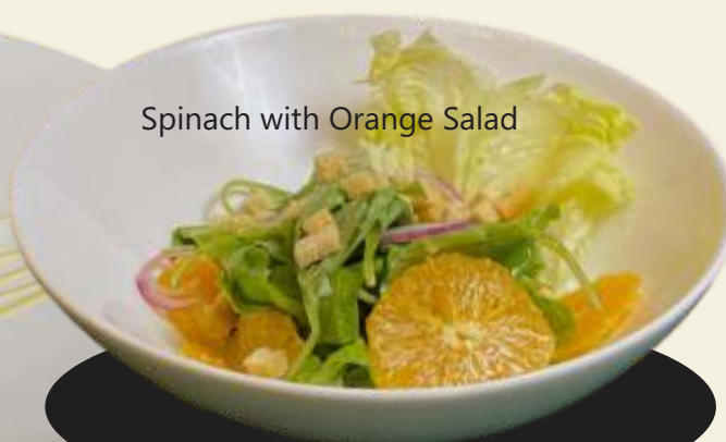
Spinach with Orange Salad